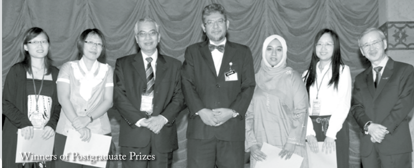
Winners of Postgraduate Prizes