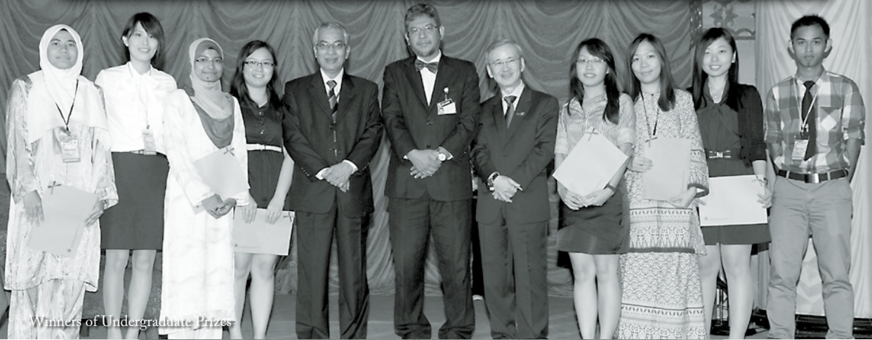
Winners of Undergraduate Prizes

This year, six Postgraduate Prizes and eight Undergraduate Prizes were awarded.